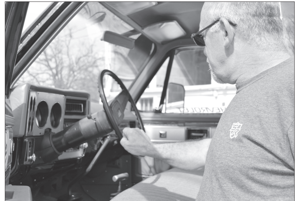
KNEESKERN POINTS out (below) that the finished truck has the original burnt orange dashboard. An upholstery company out of Taos, Mo. had to dye black material burnt orange for the new bench seat.

"He replaced all the springs, which were